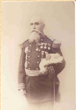
The General Nismes

T he artisans at the origin of this development are members of the Nismes Family, that later joined with the Batz Family (descendants of d’Artagnan).